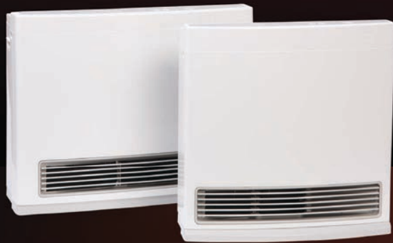
VENT-FREE FAN CONVECTORS